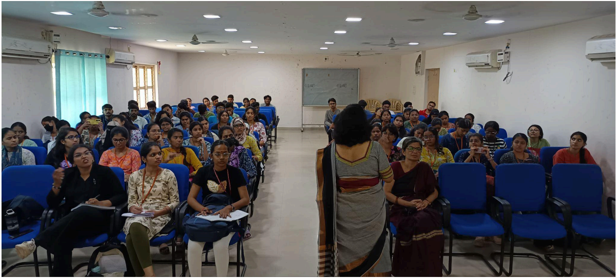
Students listening attentively to the counseling session