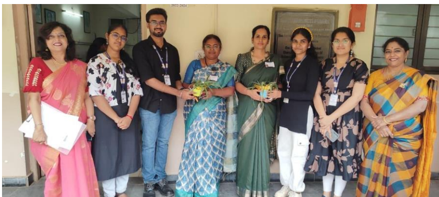
TEAM OF POSTER PRESENTATION – FACULTY COORDINATORS, STUDENT COORDINATORS AND