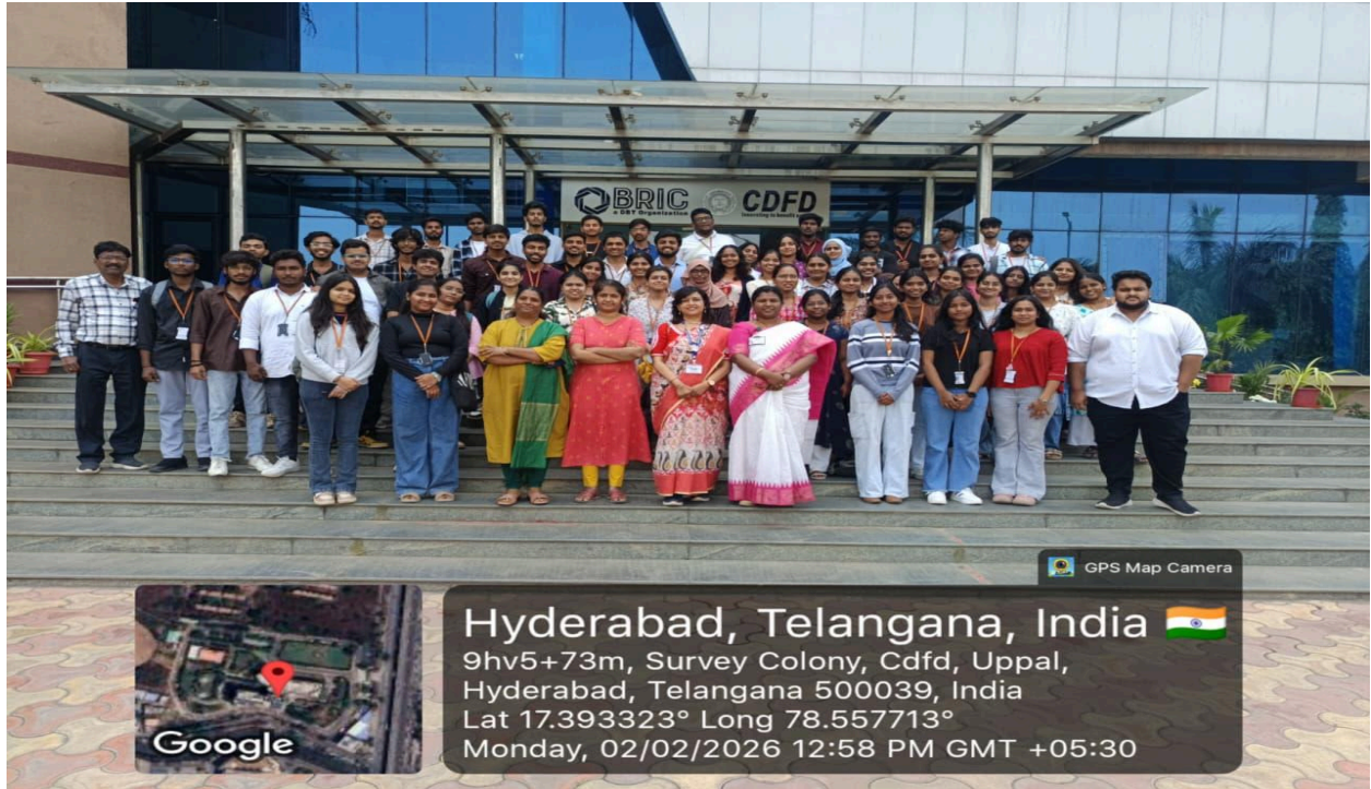
Group picture of students, faculty with members of CDFD