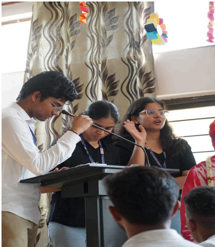
BtGC second year hosts