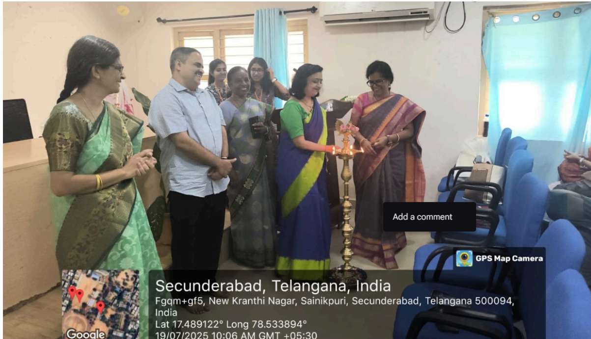
Lighting of lamp by the dignitaries