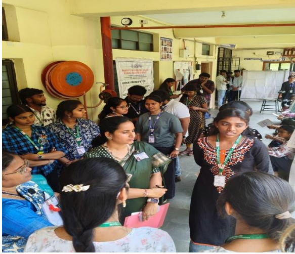
EVALUATION OF POSTERS BY JUDGES