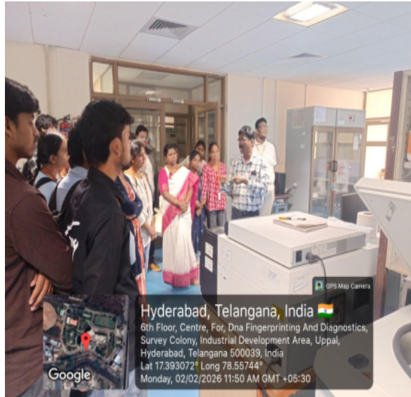
Students visit to the CFD lab with the lab instructor