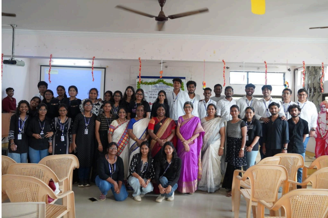
Team of the Science Quiz