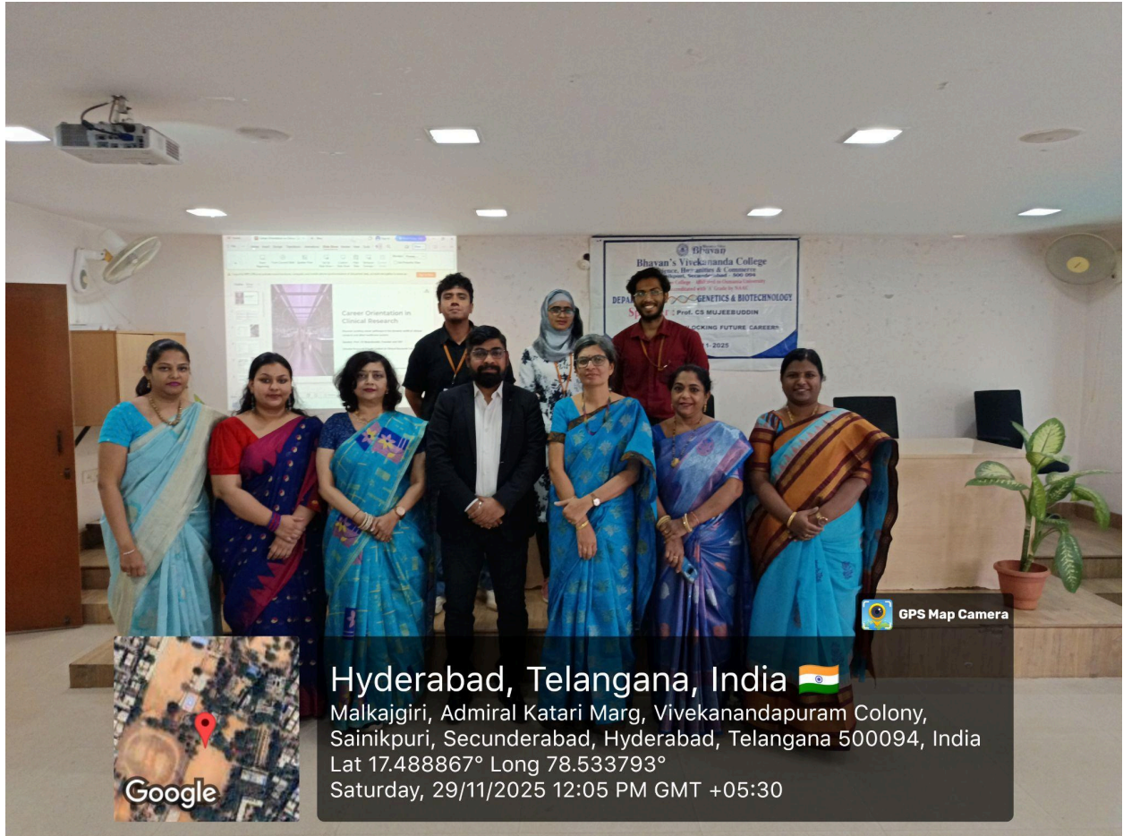
Group Picture with faculty and student volunteers