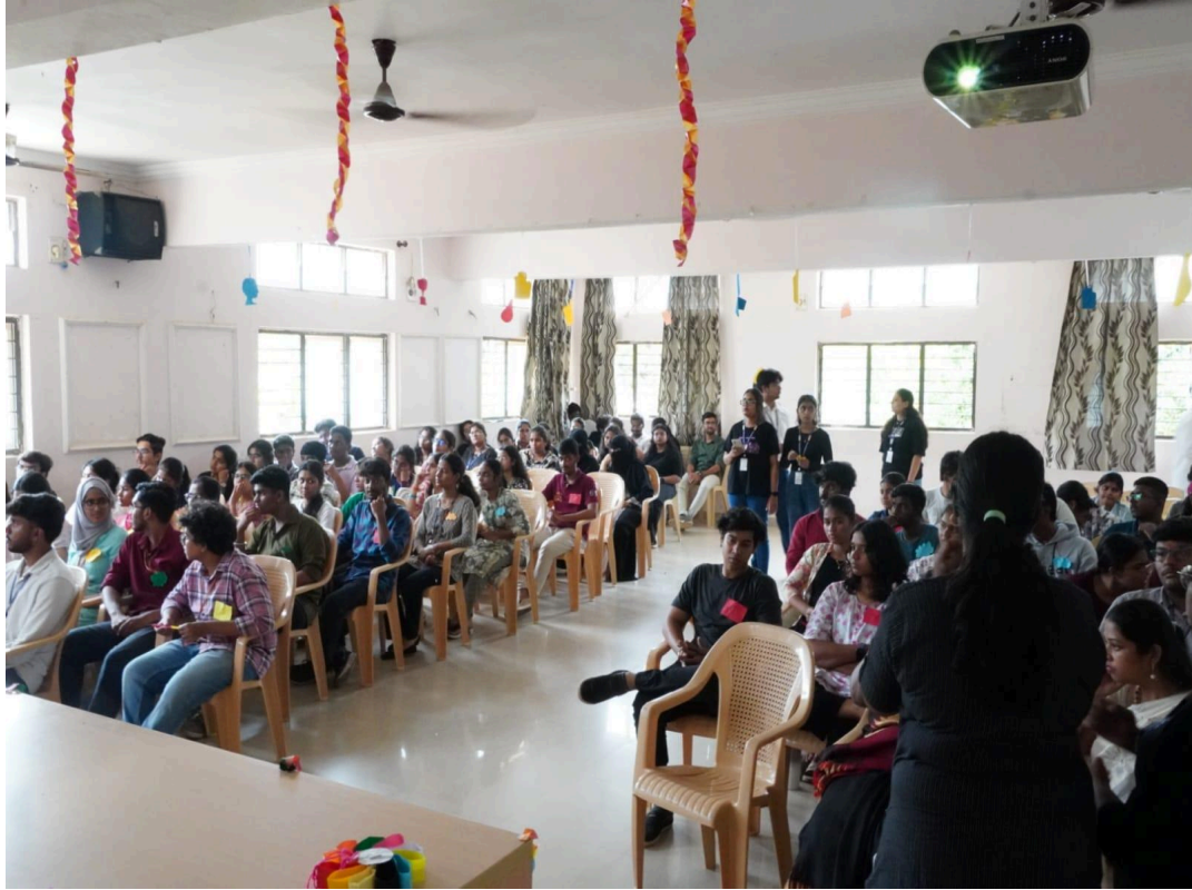
Participants during the quiz